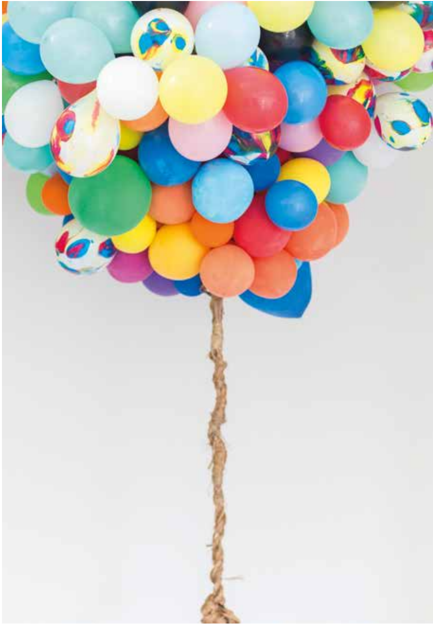
Our highly motivated Fine Art graduates include the founder of Celine Gallery Glasgow and Studio Assistant to Damien Hirst and Ian McKeever.

Recent Graphic Design awards include seven D&AD New Blood pencils, four YCN Awards and six Creative Conscience Awards.