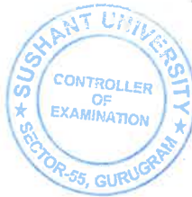
Anil Yadav Controller of Examinations