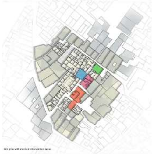
300 plan with varied construction levels