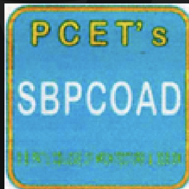
S.B. Patil College of Architecture and Design, Pune