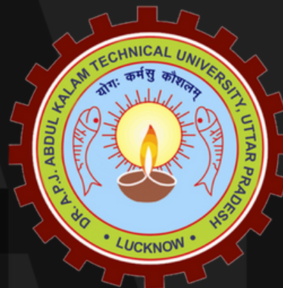
Dr. A.P.J. Abdul Kalam Technical University, Lucknow