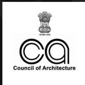
COUNCIL OF ARCHITECTURE