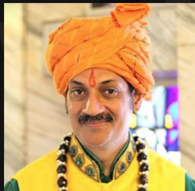
Prince Manvendra Singh Gohil, Founder, Lakshaya Foundation