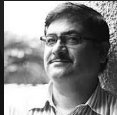
Ar. Abhay Purohit President, Council of Architecture (CoA)