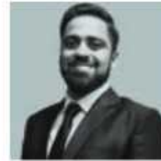
Siddhant Madan Competition Commission of India