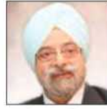
Justice R S Sodhi Former Judge, Delhi High Court