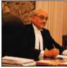
Justice Swatanter Kumar Former Judge, Supreme Court of India Former Chairperson, National Green Tribunal