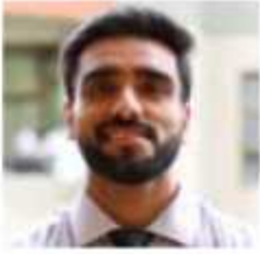
Rishav Dixit Civil Judge cum Judicial Magistrate Madhya Pradesh