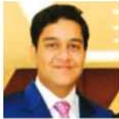
Sohal Gehlot King's College (LLM), London