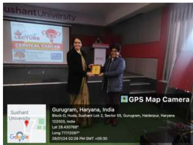
Description (min 250 to max 800 words)*

The awareness session on cervical cancer was conducted on 29 th January 2024 with the primary aim of educating participants about the causes, risk factors, symptoms, and preventive measures associated with cervical cancer. The session was organized by Department of Pharmacy, School of Health Sciences Sushant University in collaboration with Fortis Memorial Research Institute Gurugram. The awareness session took place at D421 Auditorium Sushant University Sector 55 Golf Course Road Gurgaon, providing a comfortable and conducive environment for learning and discussion.